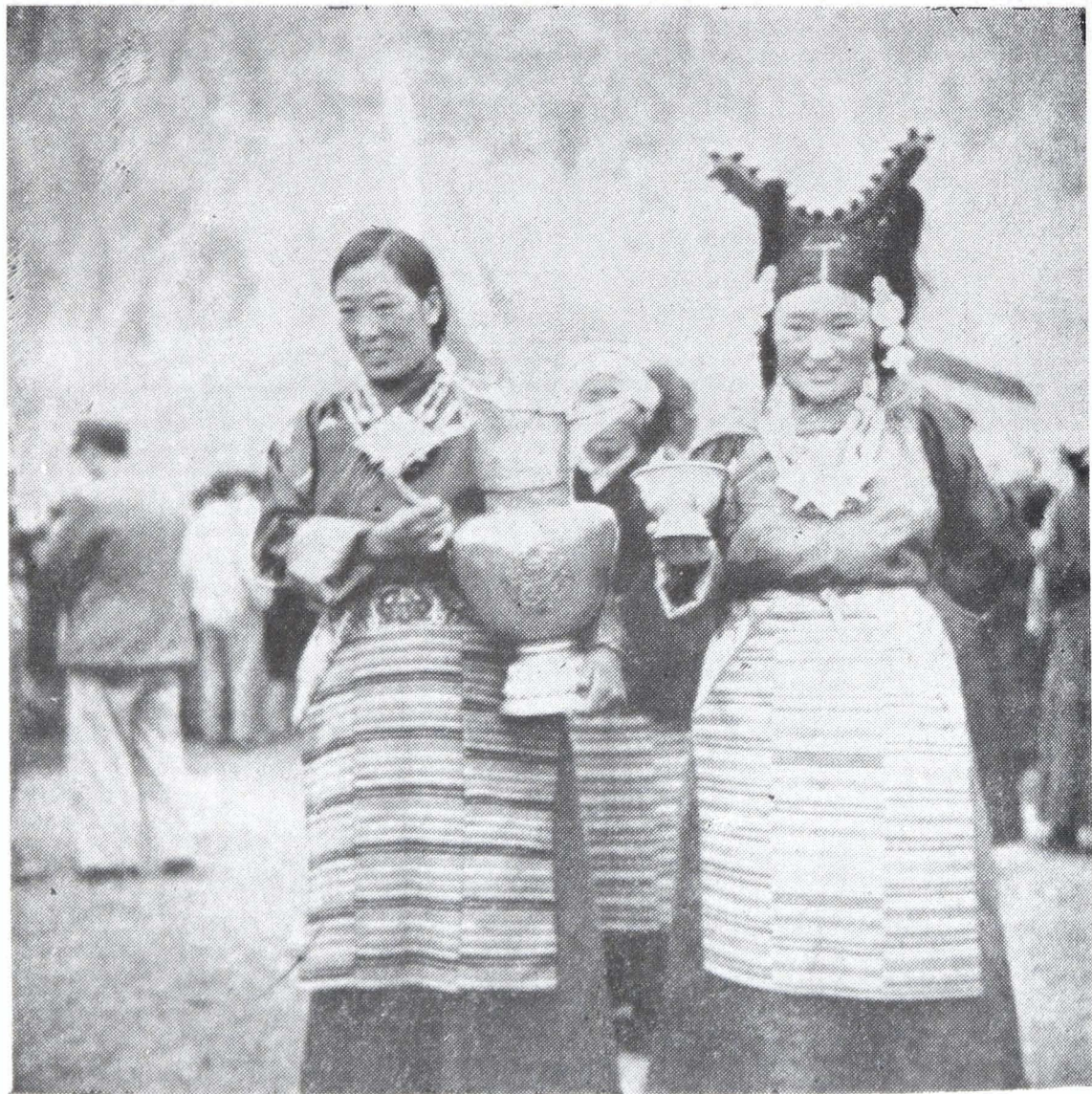
Girls in fancy dress dispense barley wine