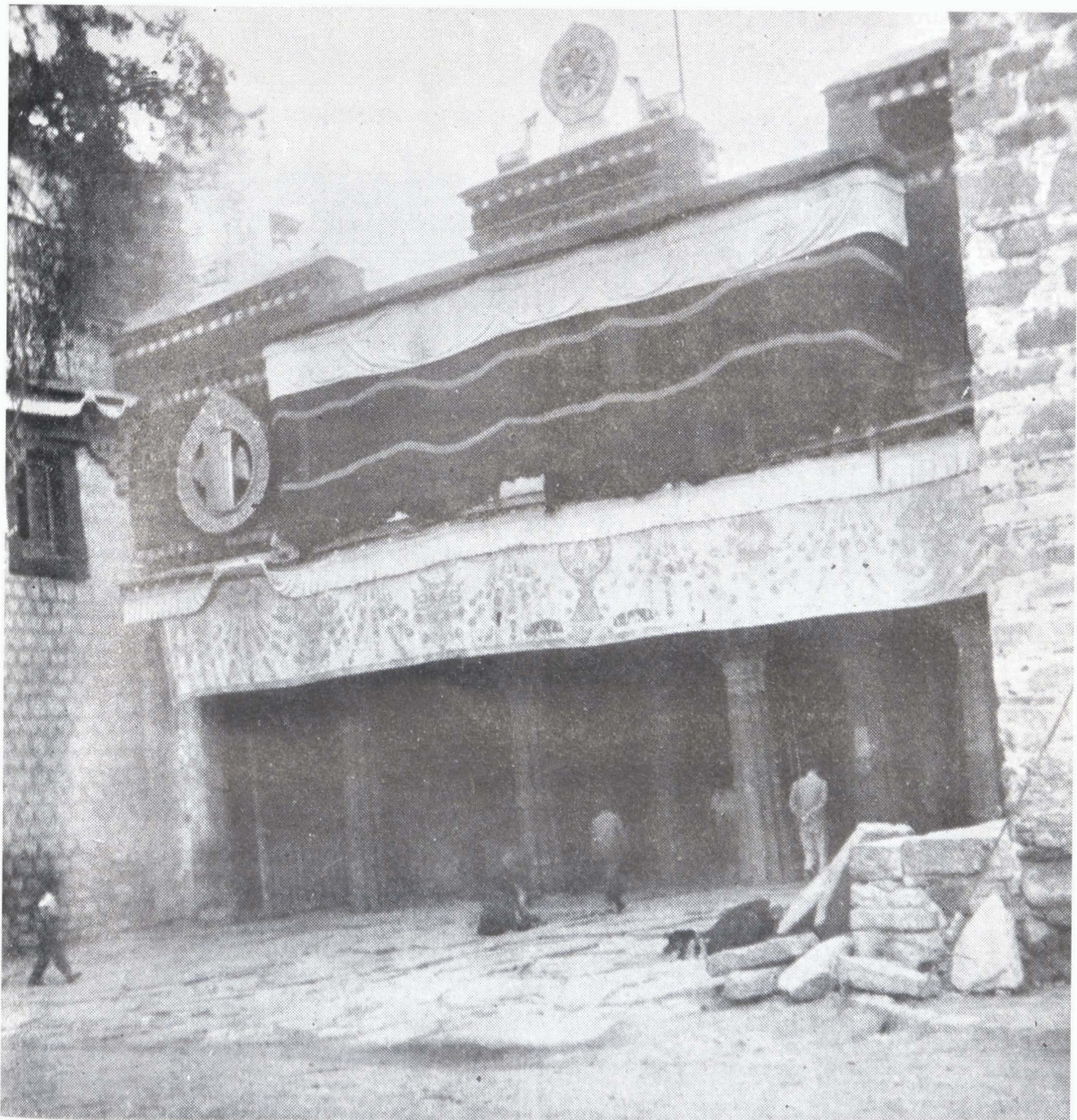
Entrance to Jokhan with prostrate woman approaching