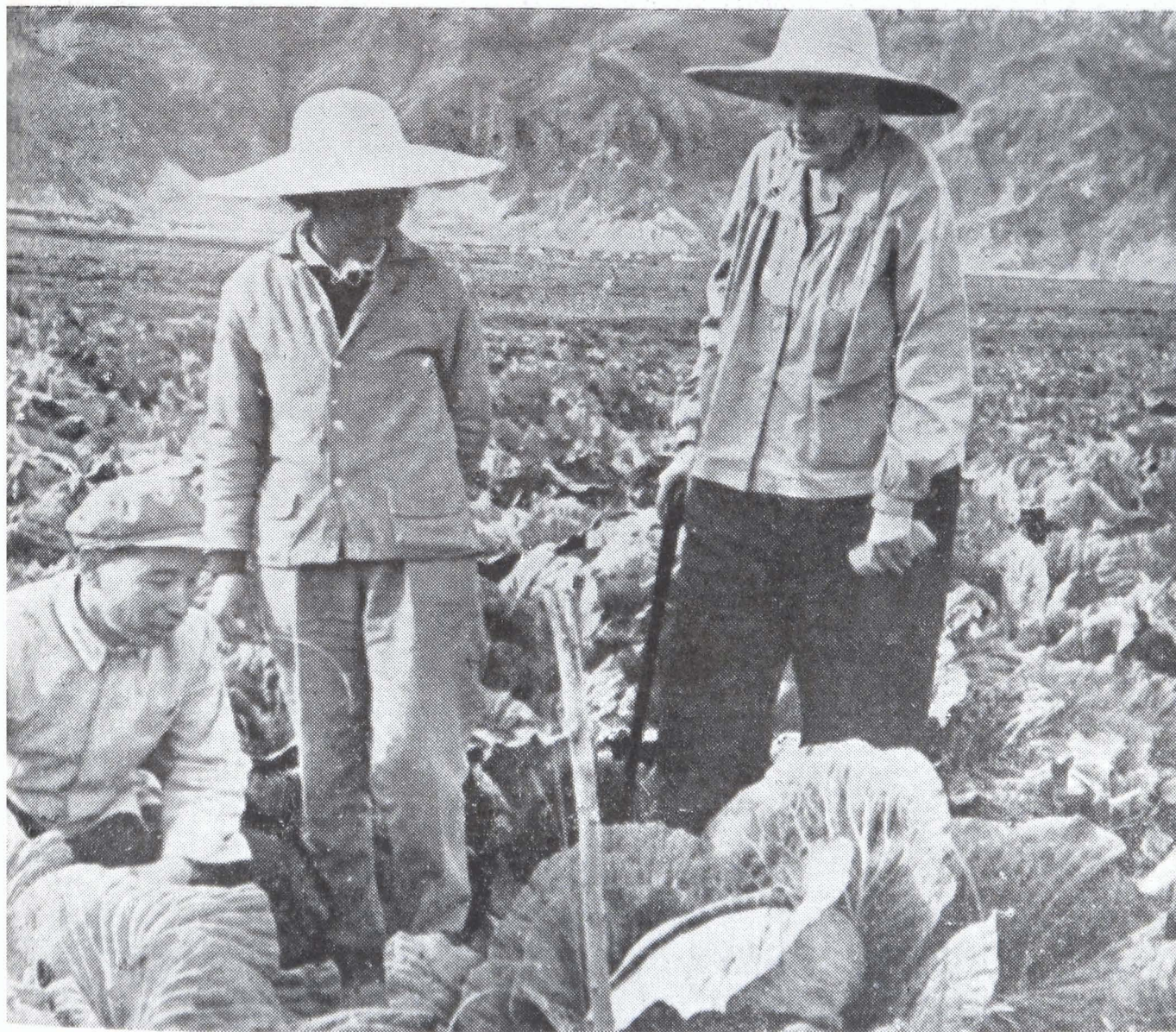
Author views big cabbage crop at Experimental Farm