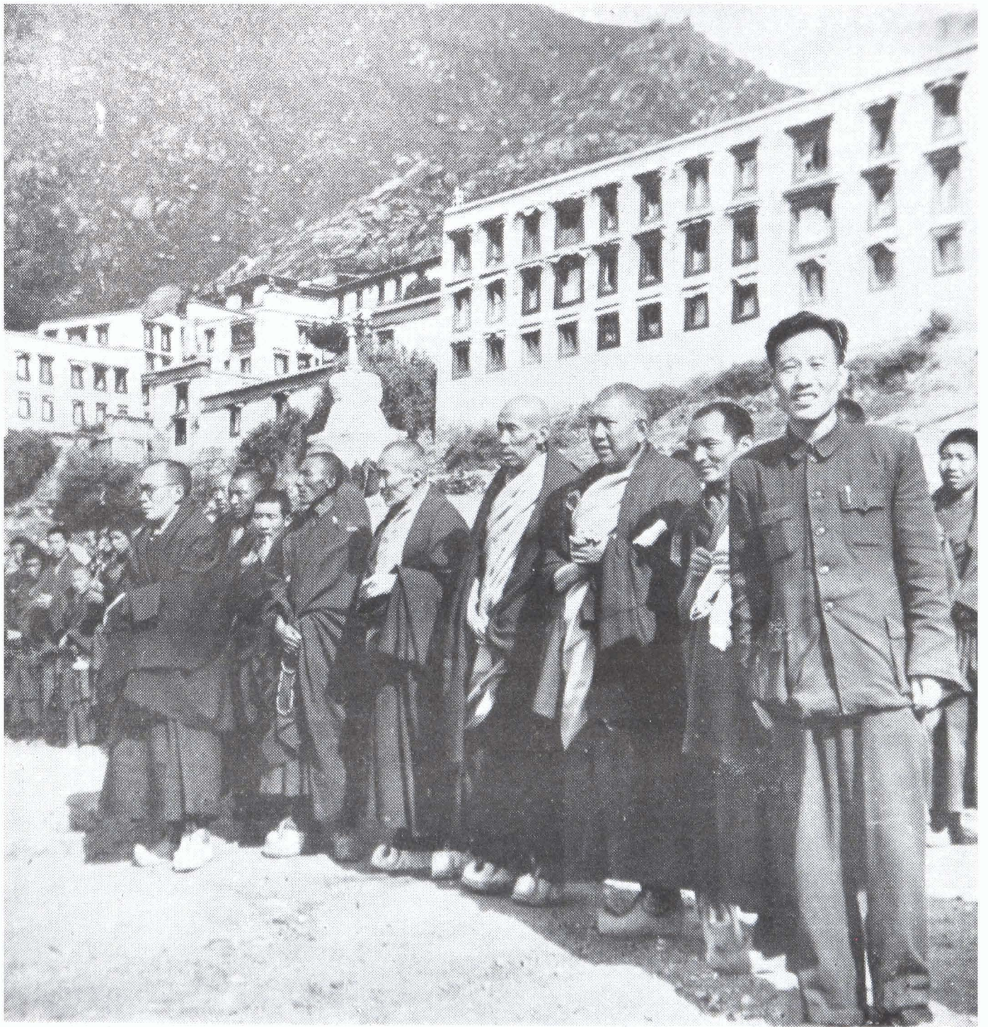
Reception Committee at Drepung, the fat upper lamas, the thin lower activist lama, the tall man from the working-team