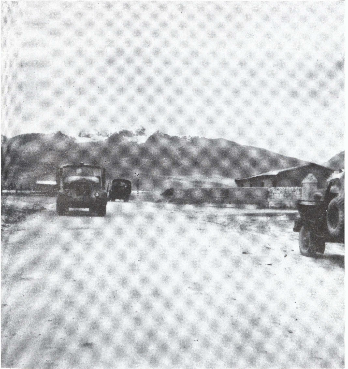
We take the famous Chinghai-Lhasa highway