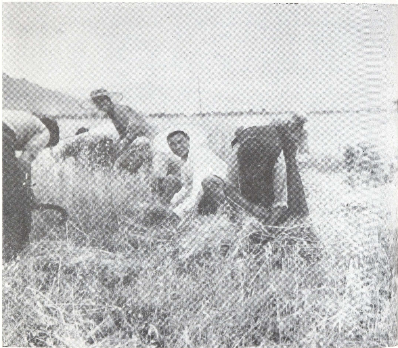
The PLA helps with the reaping