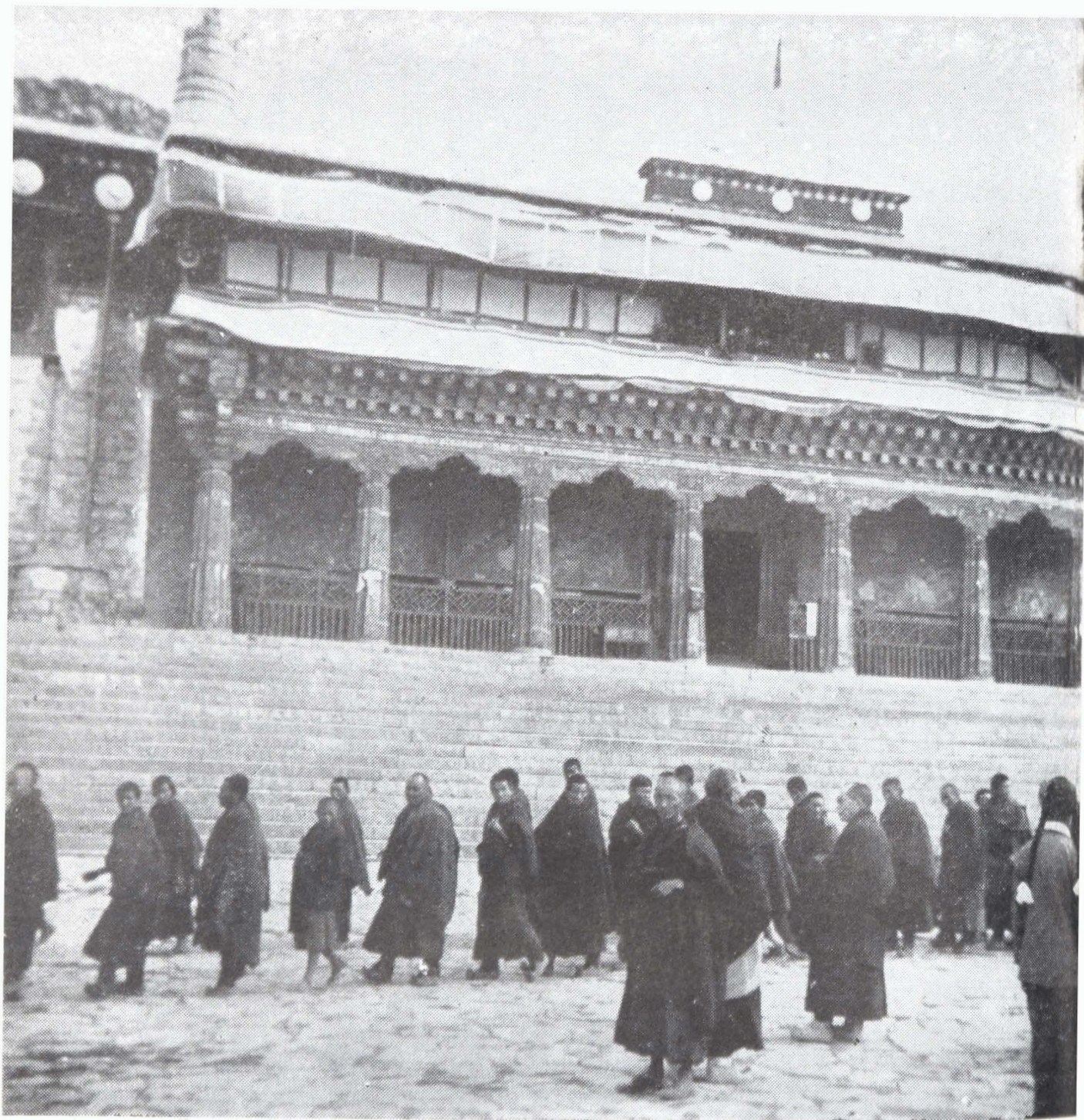
Drepung's main chapel with lamas going to "accusation meeting"