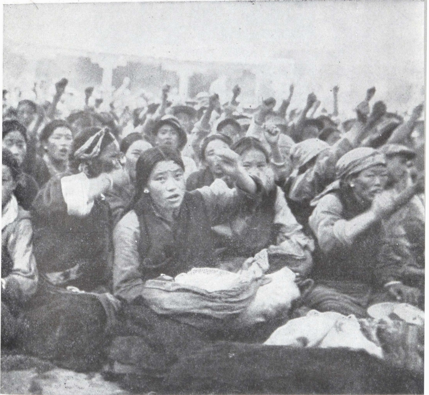
"Confess! Repent!" shout 800 former serfs