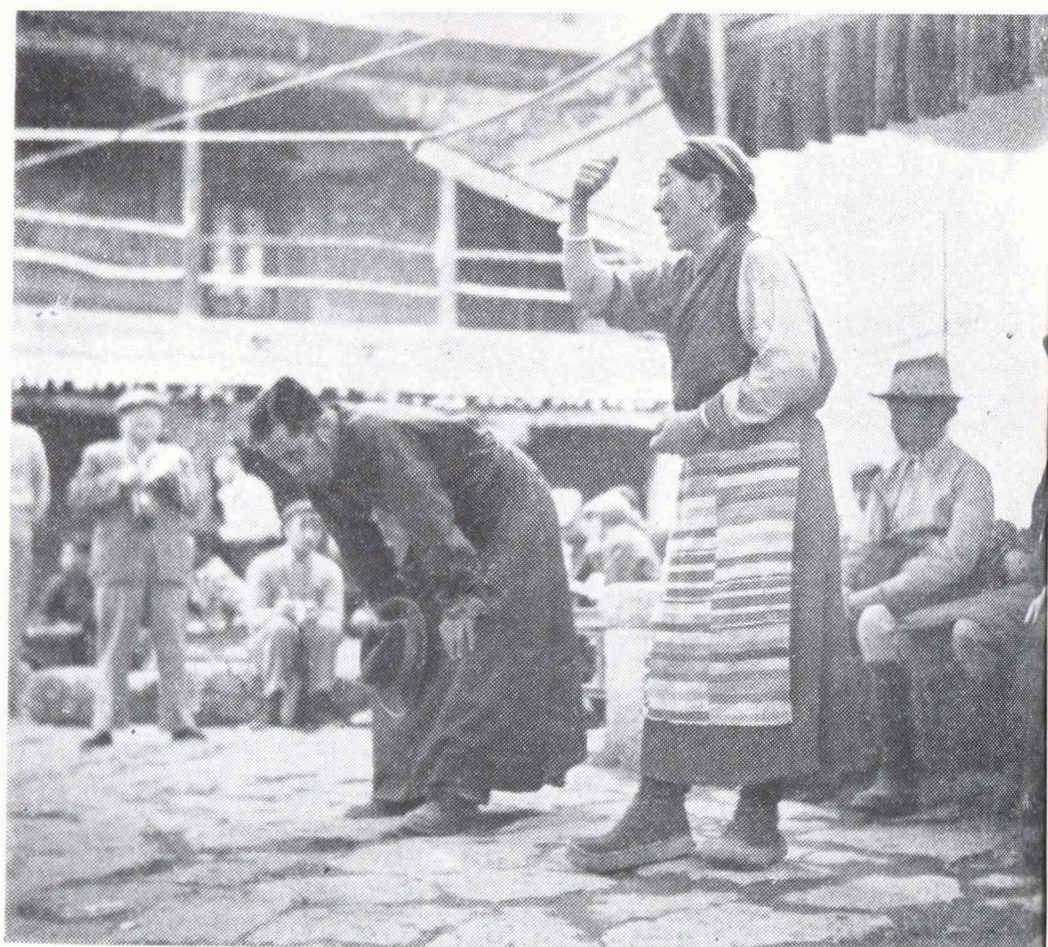
Woman serf accuses Lhalu in "accusation meeting"