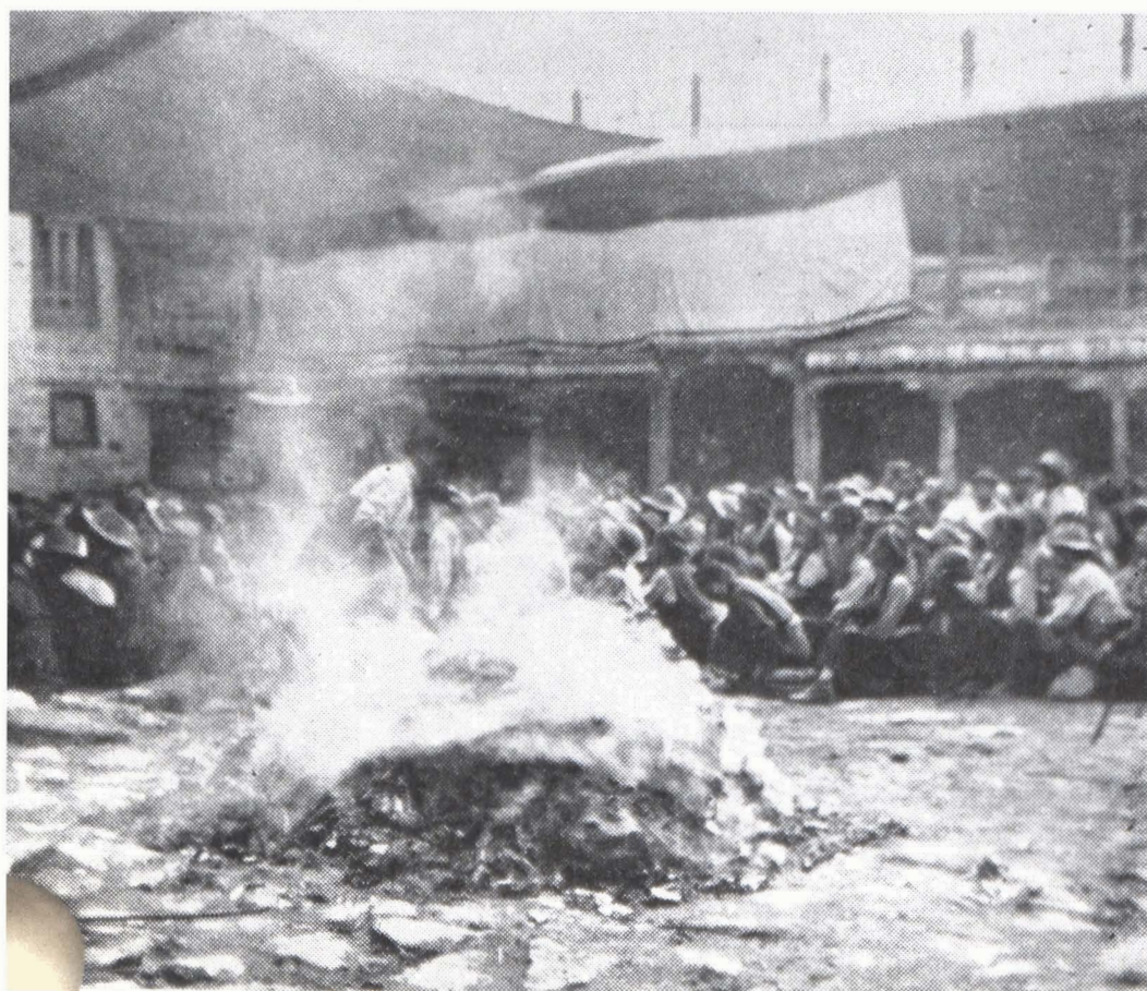
Feudal debt-titles burn in Lhalu's courtyard