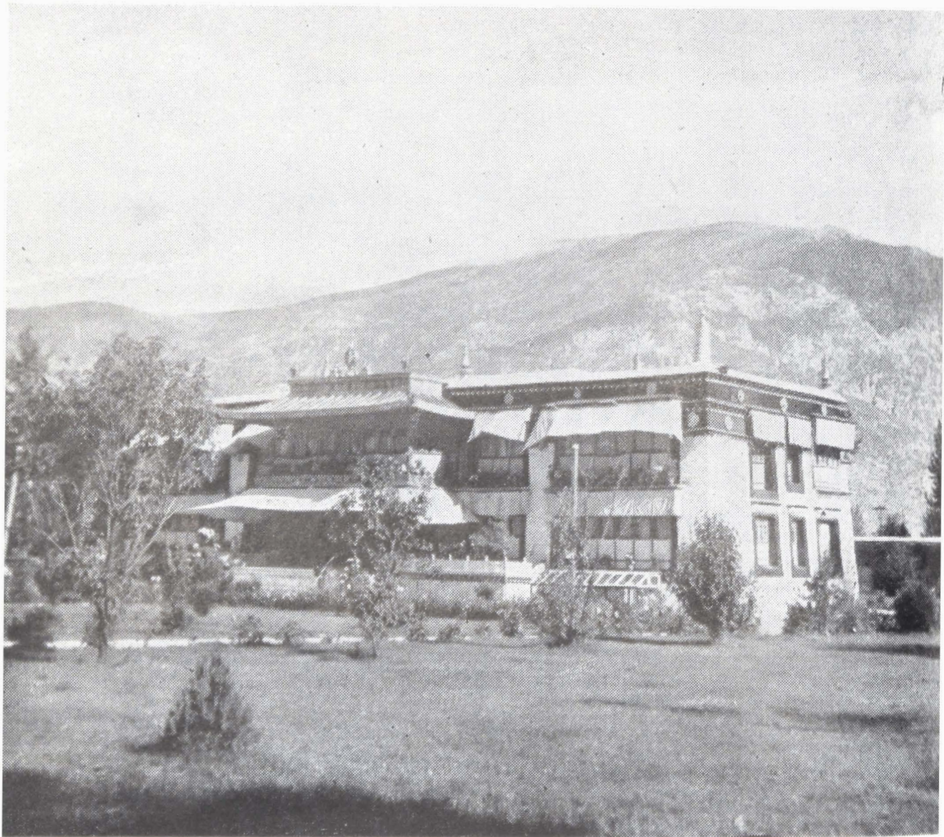
The Dalai Lama's abandoned summer palace