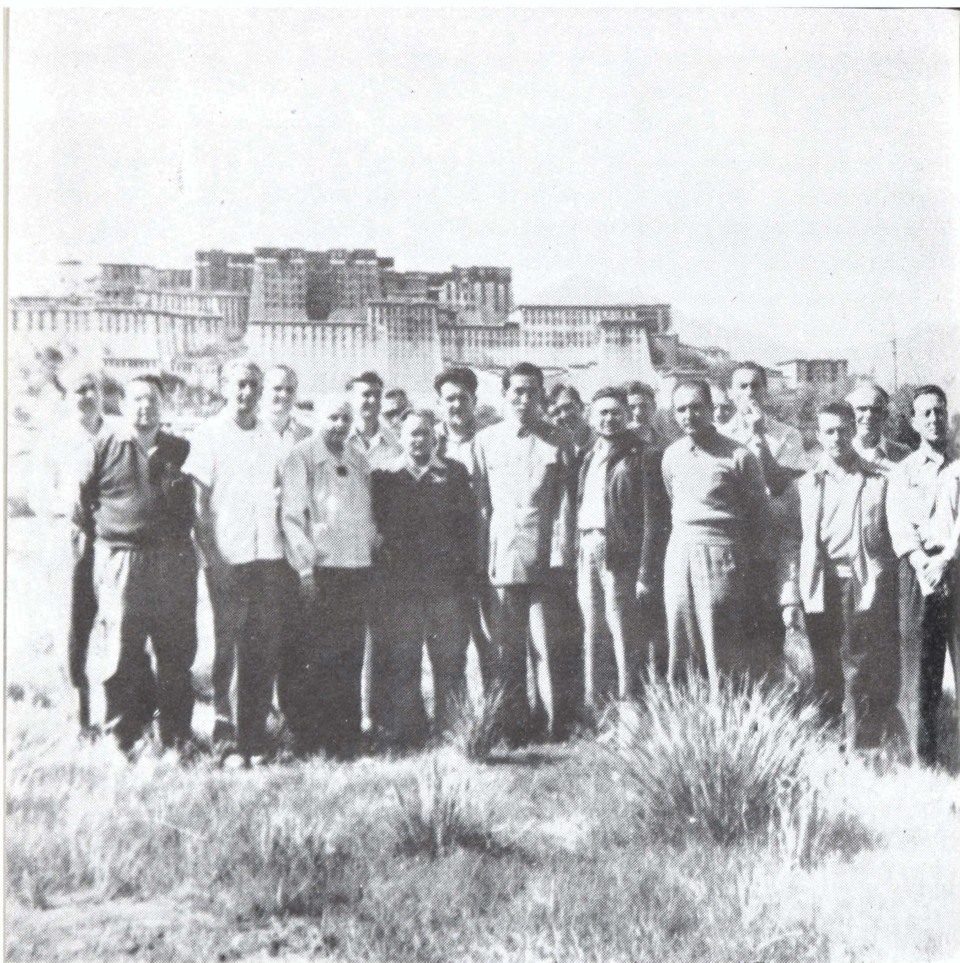
Nineteen correspondents from twelve countries reach the Potala Palace