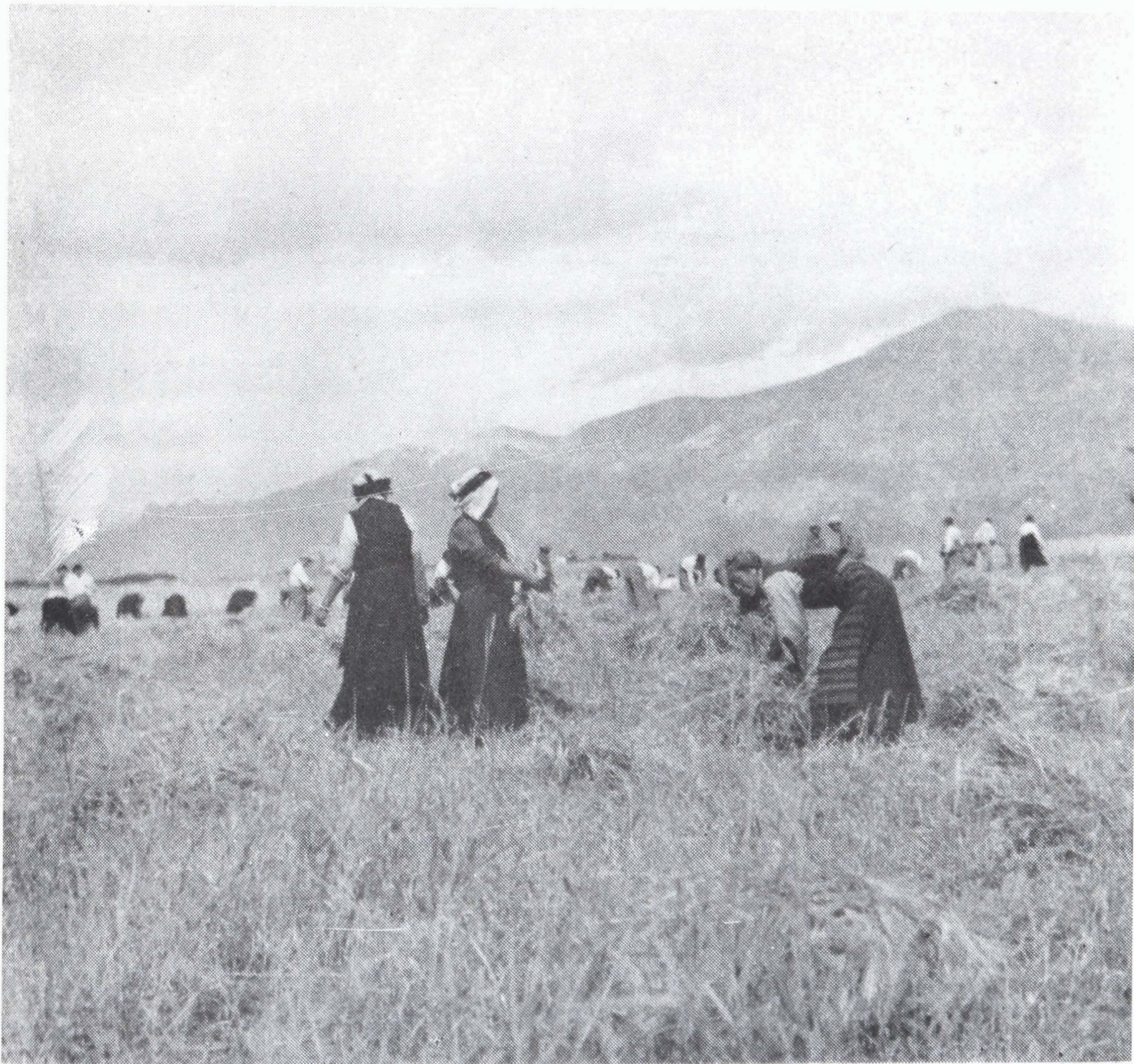
The first field reaped near Lhasa