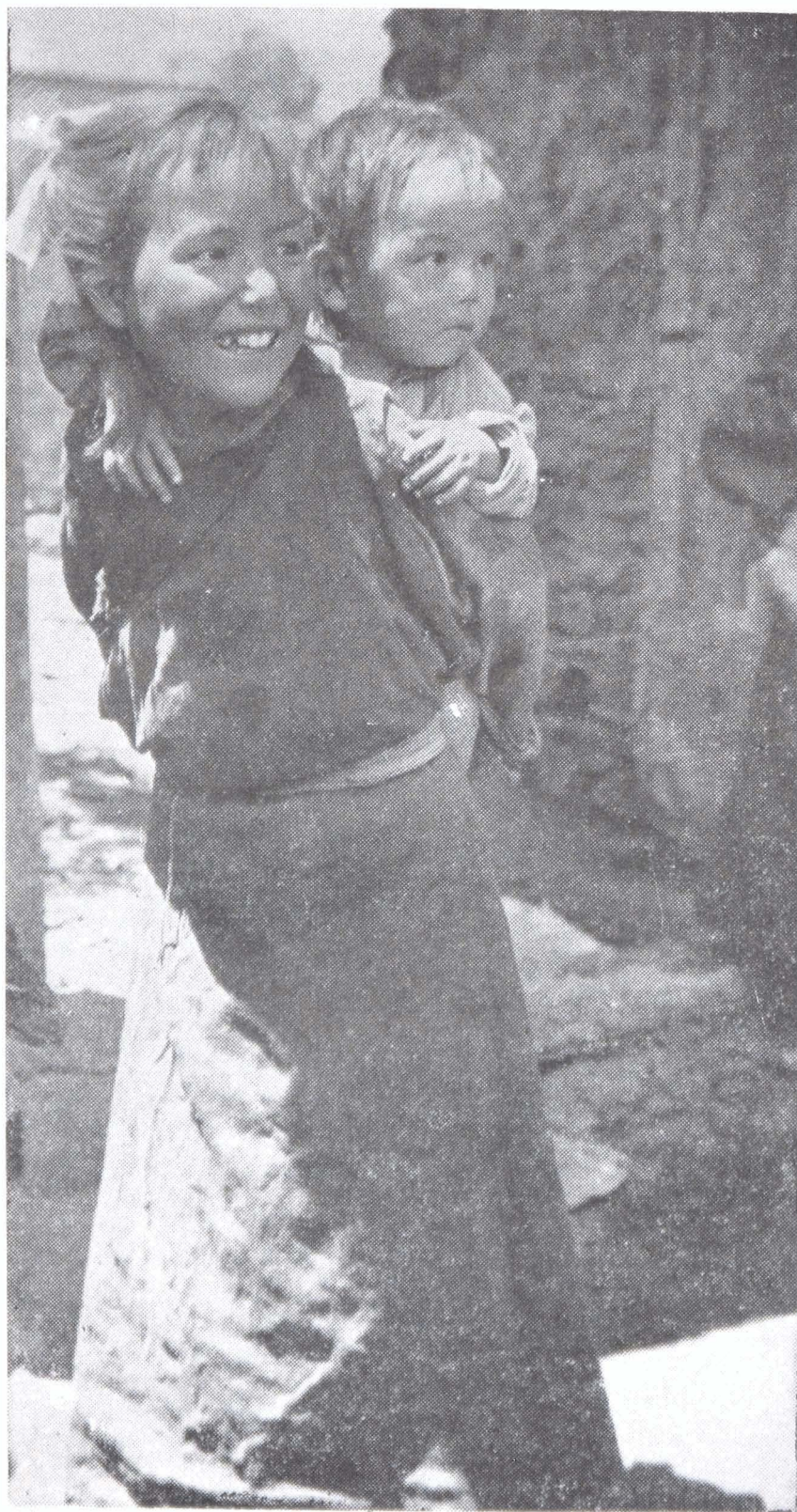
Hopeful youth in village east of Lhasa