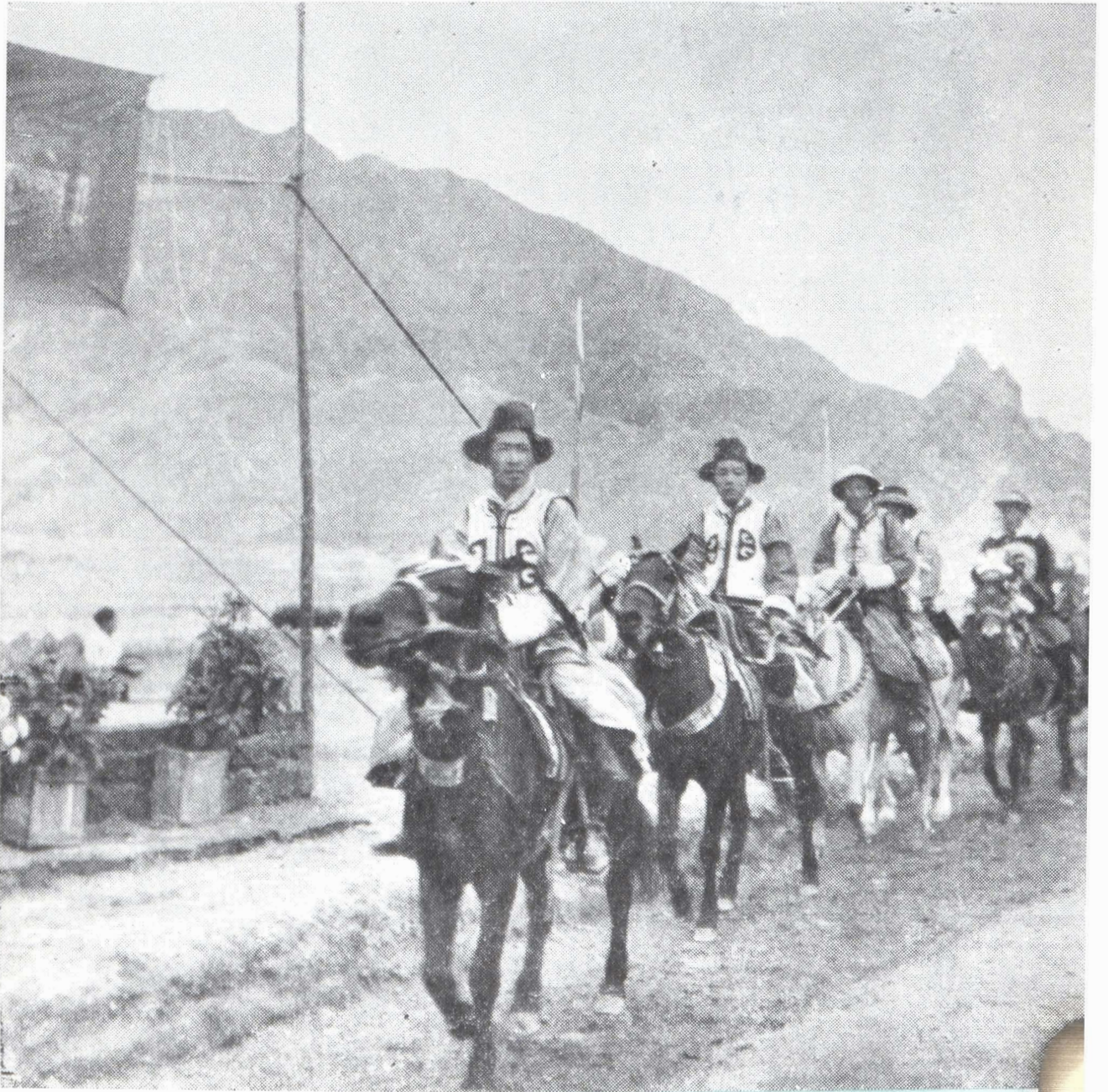
Exhibition riders at harvest festival