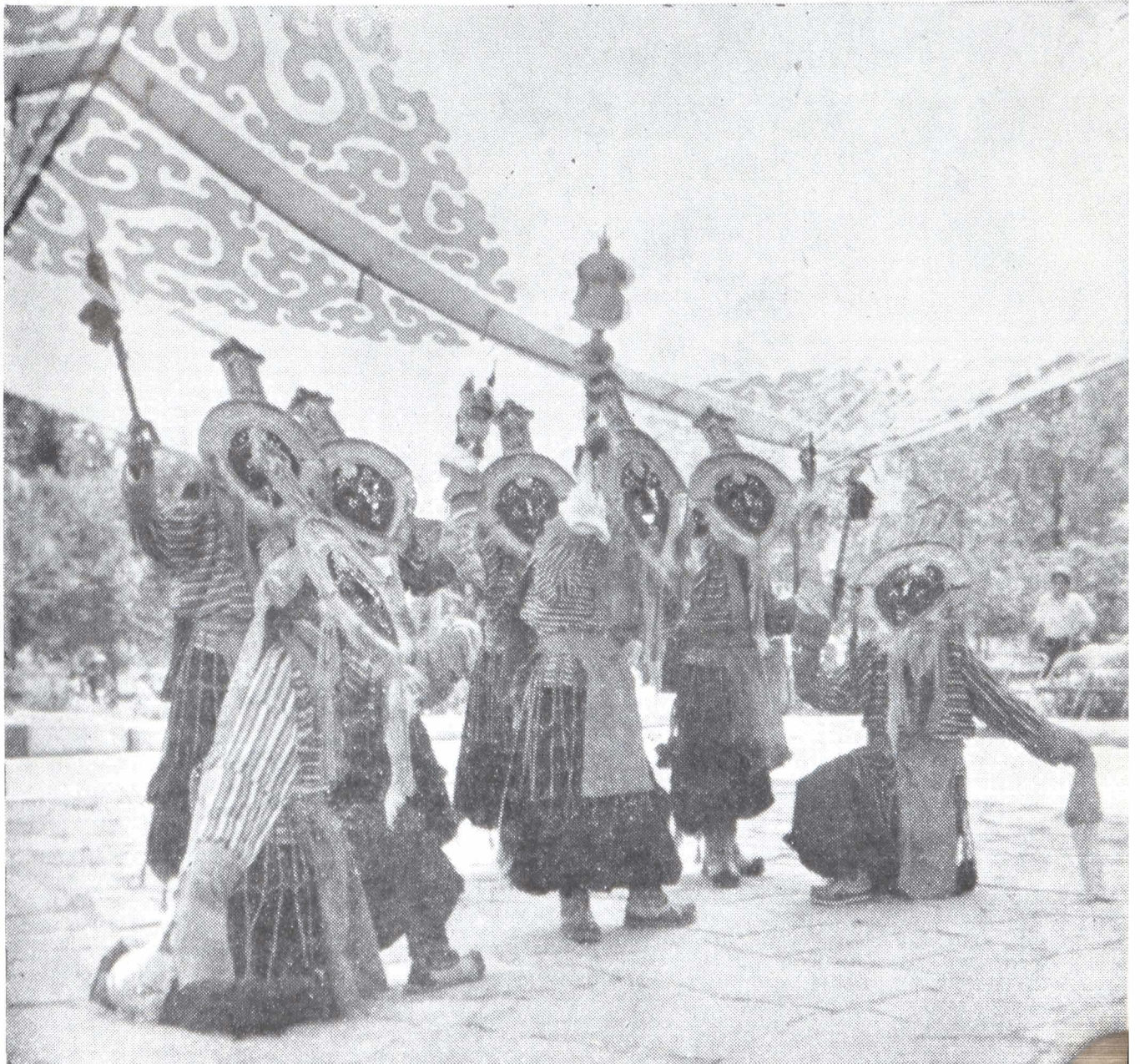
An ancient Tibetan opera in Jewel Park