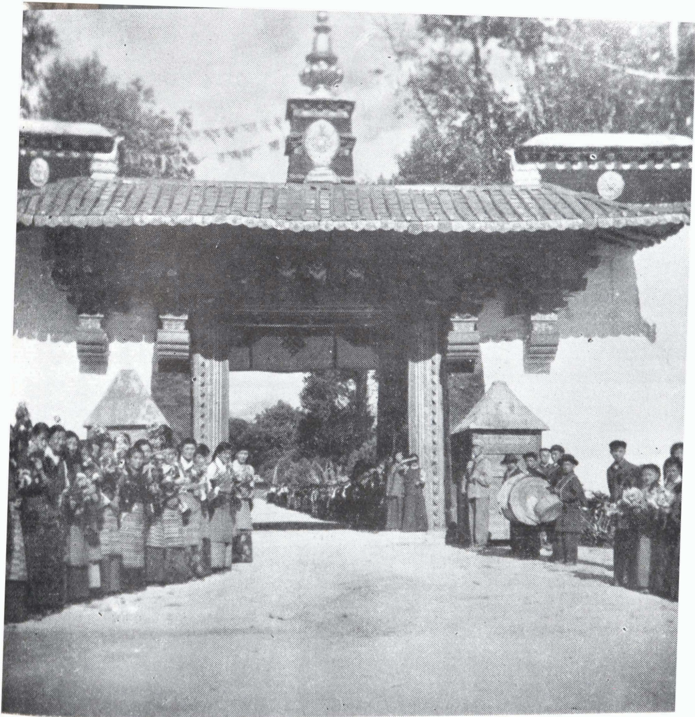
Greetings at Jewel Park's newly repaired gate